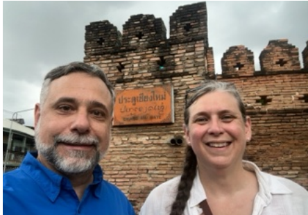
Ancient Chiang Mai city gate