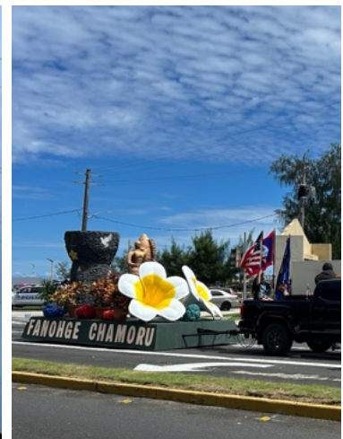
Liberation Day parade float